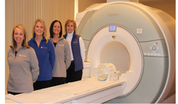
3T Large Bore (Opening) Scanner